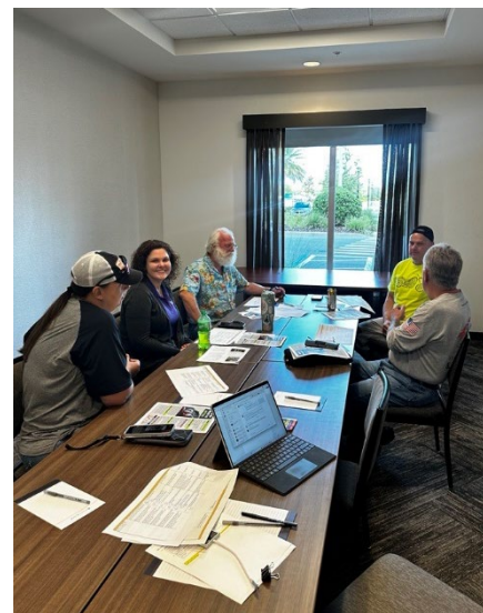
Figure 9. Rider Licensing and Training Emphasis Area breakout.