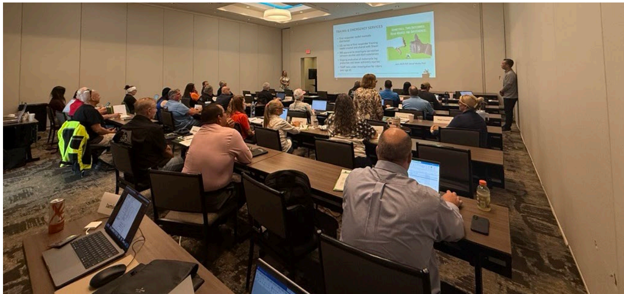
Figure 1. August 2025 Florida Motorcycle Safety Coalition Meeting, Day 1.